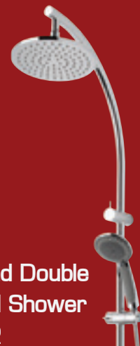
Round Double Head Shower C3-2