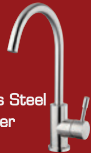
Stainless Steel Sink Mixer FSSS1