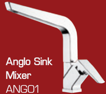
Anglo Sink Mixer ANG01